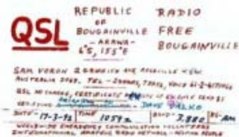
Radio Free Bougainville QSL card

Francis Ona, dissatisfied with the peace process and perhaps also feeling sidelined, seized weapons slated for disposal and retreated into the mountains of central Bougainville around Panguna mine with a small band of supporters. He declared sovereignty as President of the Mekamui National Congress, which seeks independence for Bougainville. (Mekamui translates as "Holy Land" in the local dialect