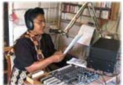
93FM Tonga.

Pacific nations are being flooded with American and now British evangelists securing AM/FM/SW/TV facilities. The list of countries hosting them grows longer every year, and New Zealand based UCB International (which has a partnership arrangement with HCJB and TWR) is also heavily involved. UCB is a spin-off from Radio Rhema. They have FM stations in Tonga, Vanuatu and Papua New Guinea and expect to announce new stations in two other Pacific islands shortly. They're also in Australia.