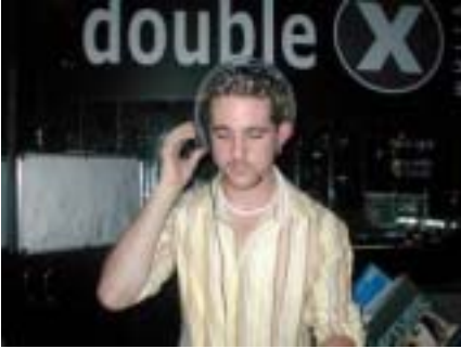
'3XX 1611' DJ